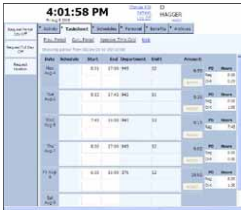
With a Tasksheet, the employee enters in and out time whenever it is convenient instead of punching in and out.

ESS works with the Leave Management module to simplify and automate employee requests for time off. Leave requests fully integrate with your Attendance on Demand management dashboard, eliminating paperwork and communicating essential information to both the manager and employee.