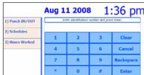
Centrally located kiosks provide secure access for all employees.