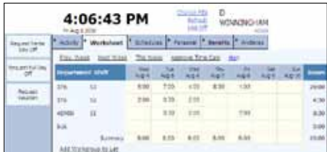
Employees use the Worksheet to enter their total hours on designated tasks or in specific departments.

Different employees can have different ESS options to meet their needs. For example, hourly employees can have a traditional time card with function keys for punching. Salaried employees can enter their hours by project.