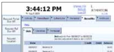
Employees can efficiently review benefit balances and request leave online.